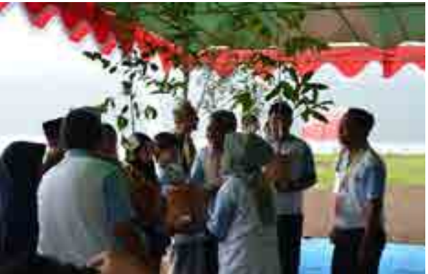
Presenting tree to the local community and representative of participants