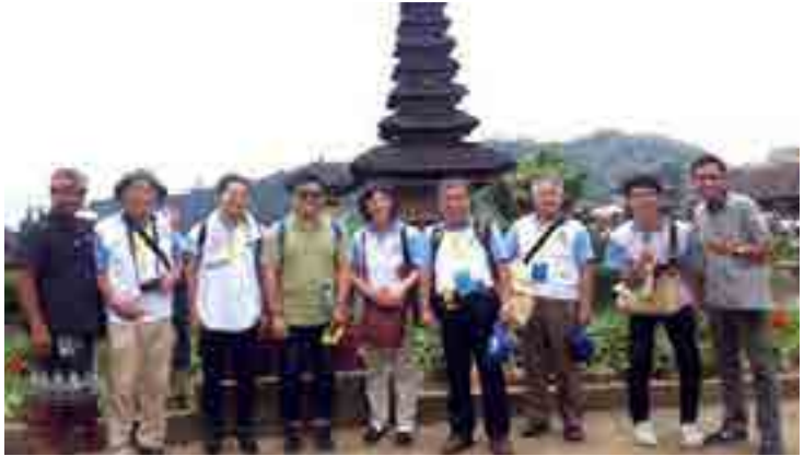
The Group at Pura Ulundanu Lake Bratan