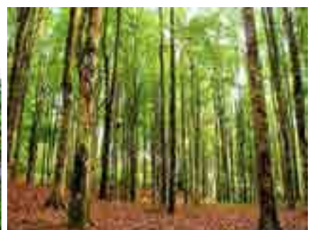
Bali Botanical Garden