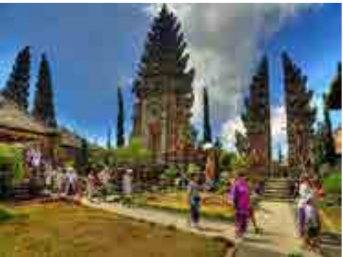
Pura Ulundanu in Lake Bratan