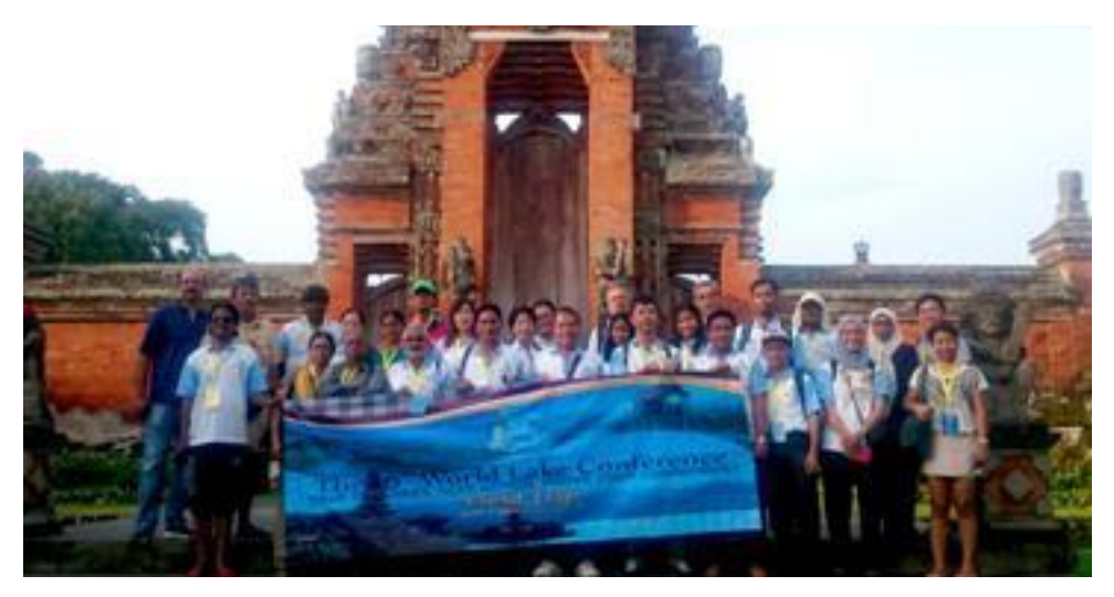
The Group at Pura Taman Ayun