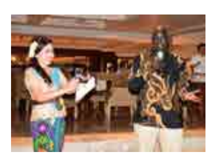
Welcome Reception The Ponds Restaurant – Open, November 6, 2016, 19.00 – 21.00