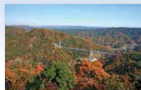
Ryujin Big Suspension Bridge