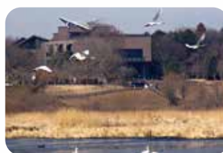
③Ibaraki Nature Museum