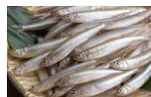
Lake Kasumigaura's Smelt