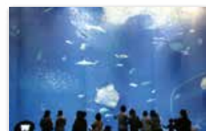
Aqua World Ibaraki Prefectural Oarai Aquarium