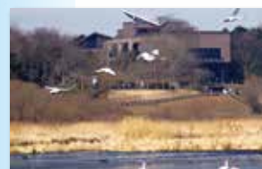
Ibaraki Nature Museum