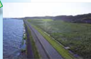
Tsukuba-Kasumigaura Ring-Ring Road