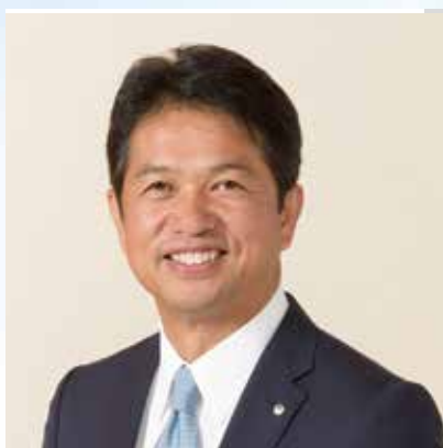
Governor, Ibaraki Prefecture Chair, Executive Committee of the 17th World Lake Conference