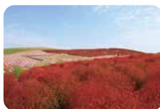
①Hitachi Seaside Park