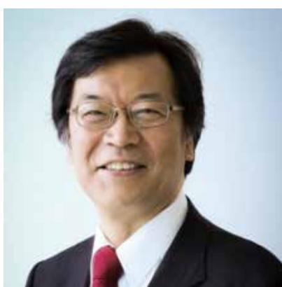
President, International Lake Environment Committee Foundation (ILEC) Vice-Chair, Executive Committee of the 17th World Lake Conference

We are looking forward to your participation of many attendees at the 17th World Lakes Conference that we can discover new knowledge and open up avenues to future prospects.