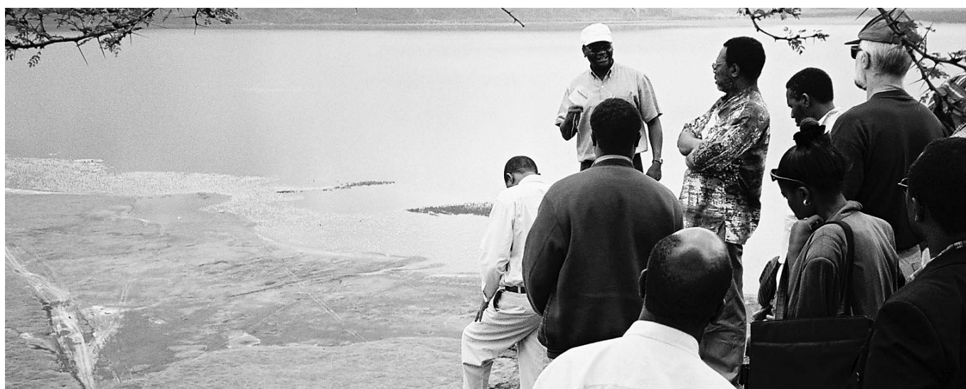
Field Trip to Lake Nakuru

The final report for the project is now being prepared based on the case studies for the African lakes together with the ones from the 1 st Workshop held in June 2003 (Americas, Europe and Central Asia) and the 2 nd Workshop held in September 2003 (Asia). The draft final report will be posted on the project website for public comment. The final report is scheduled to be ready by mid-2004.