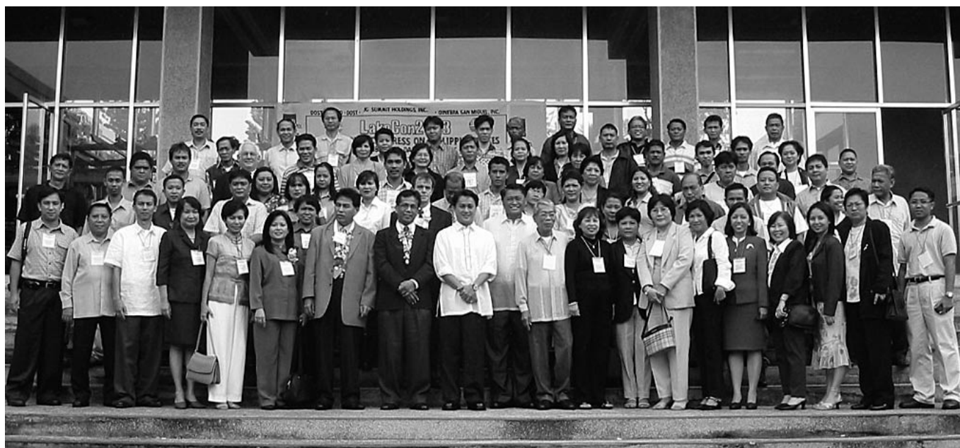
Delegates at the historic conference

The Congress came to a close with the identification of priority issues and concerns based on the workshop themes, development of the Philippine Lake Vision, the creation and election of officers of the Philippine Lakes Network and the joint declaration on Philippine Lakes aptly called, the Tagaytay Declaration.