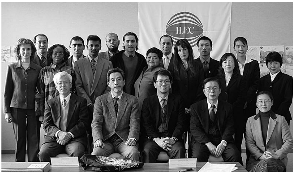
The trainees and some of their lecturers

The two-month-long 14th Group training Course in Lake Water Quality Management, one of JICA's group training courses, was held at ILEC from 18 January to 19 March, with 10 trainees in attendance. Course participants were from Argentina, Egypt, Benin, Brazil, China, Hungary, Mexico, Sri Lanka and Syria.