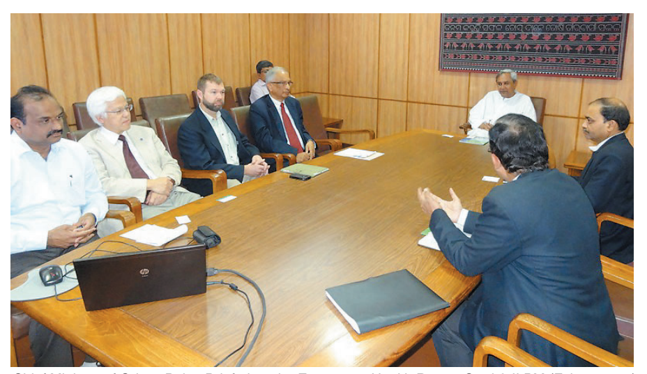
Chief Minister of Orissa Being Briefed on the Ecosystem Health Report Card & ILBM (Feb. 6, 2013)