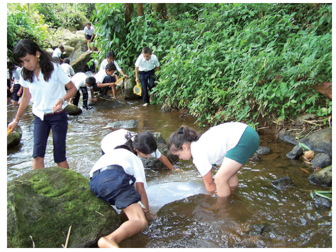
A Water Quality Workshop with Macro Invertebrates in Sarapiquí, Costa Rica

project of some strategic institutions their that have activities in the influence area. This group will become the main board in charge of approving the specific actions improve and maintain the health of the basins and to assure a better life quality for the people live in the GAM.