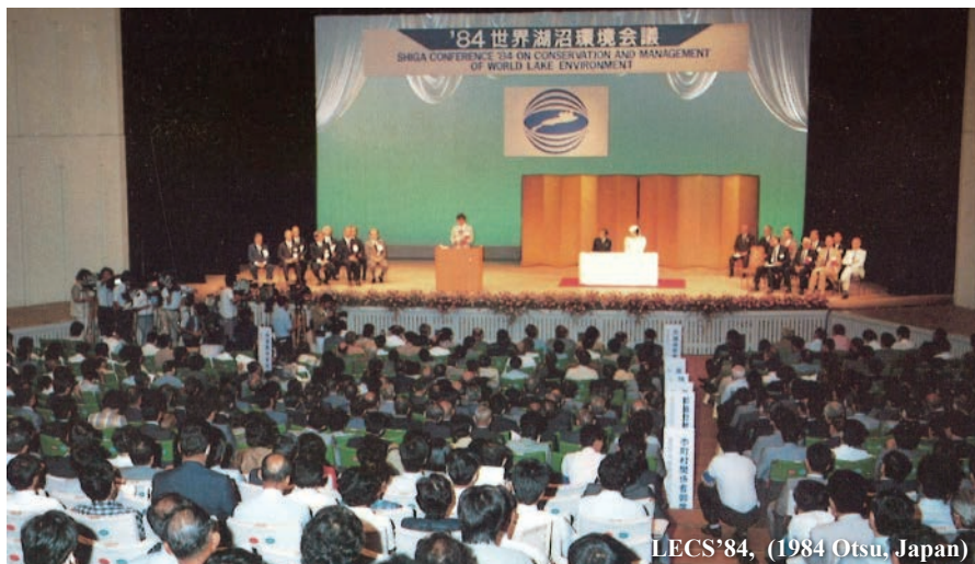
LECS'84, (1984 Otsu, Japan)