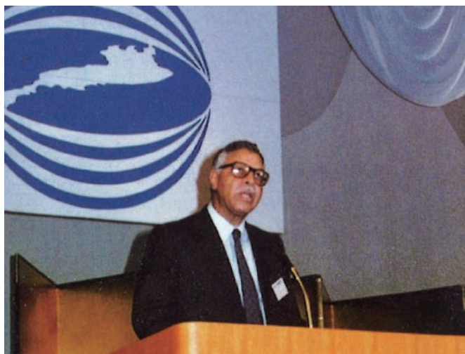
The late Dr. Tolba at LECS'84 (Otsu, Japan, 1984)

Geneva, March 28, 2016 - Former Executive Director of the United Nations Environment Programme (UNEP), Dr. Mostafa Kamal Tolba, passed away at the age of 93. Dr. Tolba was a key figure behind the birth of ILEC. His seminal contribution dates back to 1984 on the shore of Lake Biwa, Japan, where the Shiga Conference on Conservation and Management of World Lake Environment (LECS'84), which is now considered to be the very first World Lake Conference (WLC), was held. As the then Executive Director of UNEP, he proposed the establishment of an international committee to realize the trans-generational succession of the Conference and to facilitate the development of a rational management plan for lakes and reservoirs and their basins. (The related article is featured on the cover page of this Newsletter.) Without his proposal, ILEC and WLCs may have not been established and flourished over time.