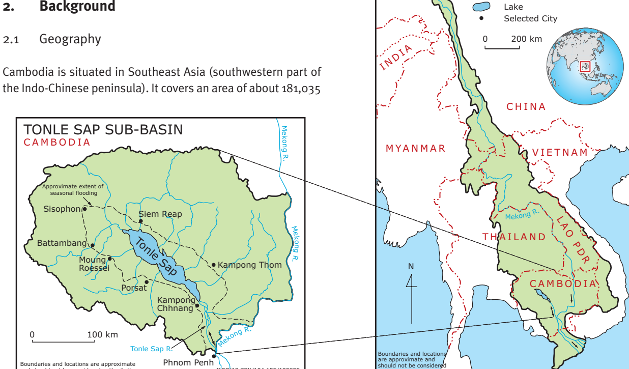
Figure 1. The Tonle Sap and Mekong River Basins.

Cambodia is situated in Southeast Asia (southwestern part of