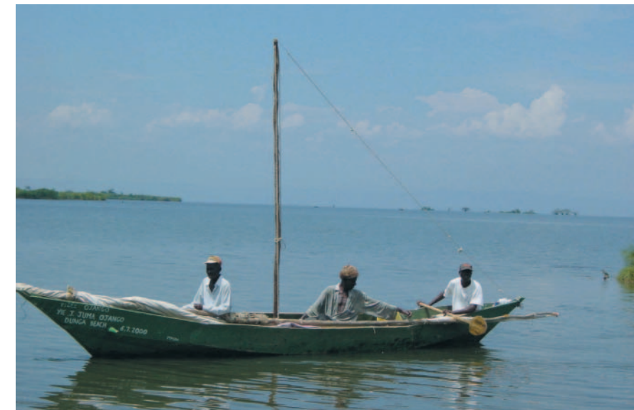
A harmonious relationship between humans and lakes is a cornerstone for addressing the needs of both.