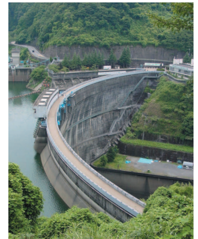
Humans have constructed reservoirs around the world to meet beneficial water needs.

Lakes also are significant repositories of natural and human history, with ancient local political centers often arising on or near lake shores. Specific lifestyles based entirely on lakes and their resources have developed in some locations, an example being the indigenous cultures in the Lake Titicaca drainage basin in Bolivia and Peru. Lakes also have fundamental religious and spiritual sig-