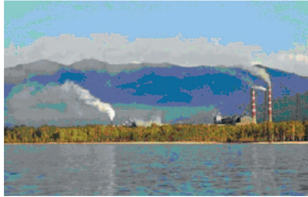
The long-range transport of airborne pollutants can cause water pollution problems far from the pollutant source.