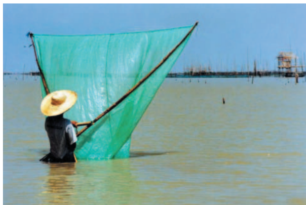
Sustainable fisheries are essential for the livelihood of many indigenous communities.

sustainable catch limits, and managing fisheries with such measures as fishing permits and fees, net or gear size requirements, harvesting seasons and limits, fishing technologies and harvest area restrictions. Measures to protect the shoreland ecosystems, involving local communities, commercial fishing operations, and other stakeholders, should be included in a sustainable fisheries management program. Certain zones can be reserved for selected fisheries, particularly traditional or indigenous fisheries. Development and enforcement of equitable, sustainable fishing regulations also is critical, but presently insufficient for many lakes. Further, provision of alternative employment opportunities for off-peak fishing periods (e.g., ecotourism) should be considered in a fisheries management program.