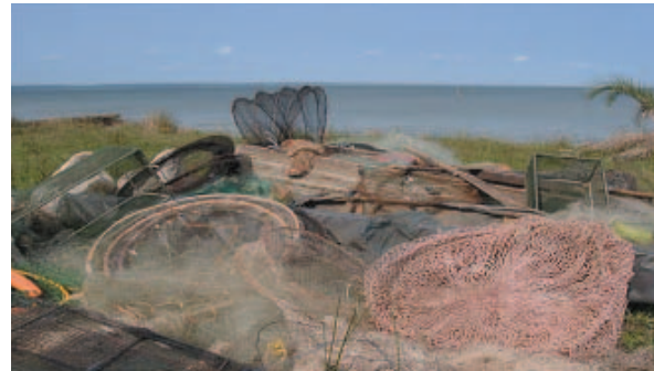
Examples of fishing nets and gear that are illegal in some countries

Increased erosion and sedimentation can result from deforestation and other land and soil disturbances associated with clearance and conversion of land to agricultural and urban purposes, producing large quantities of sediment that can enter lakes, degrade water quality, and destroy lake habitats. Sedimentation can rapidly fill many lakes, and can significantly reduce their water storage capacity and recreational potential, interfere with flow control mechanisms, and reduce their flood control capacity. The Nizamsagar reservoir in India, for example, has lost more than 60% of its water storage capacity in 40 years. The siltation of Lake Dongting in China has reduced its surface area from 6,000 to 3,000 km 2 over the last century. Sediments entering lakes also can contain sediment-bound nutrients and toxic metals and chemicals that can be released into the water column under certain conditions.