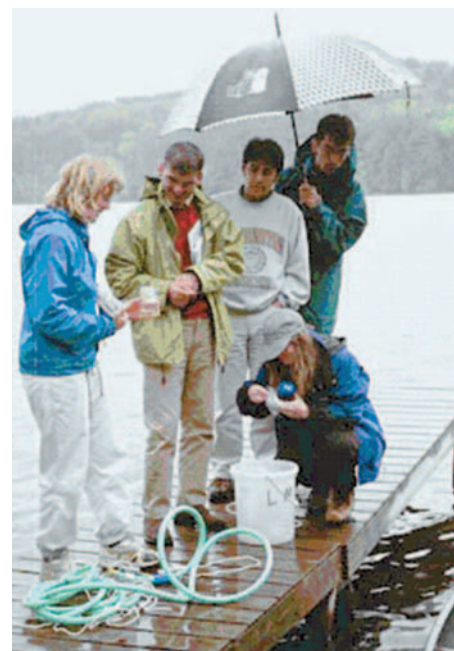
Data obtained from accurate, long-term monitoring are essential for making sound lake management decisions.

● Implement and maintain lake monitoring and assessment activities —The World Lake Vision encourages new or continuing monitoring and assessment of the state of lakes and their drainage basins, and the dissemination of the results to all lake stakeholders. It is a demanding task to select ecological and water quality indicators for lake health assessment and to establish and maintain a corresponding monitoring program. It requires continuing and concerted efforts to acquire the necessary data and information for making informed lake management decisions. Ideally, all water development projects should include both pre-project and post-project monitoring activities, as a means of both refining individual projects and for identifying case studies and lessons learned for future projects. Monitoring activities can be undertaken by individuals, governmental agencies, non-governmental organizations, corporations, and academic institutions at all levels. Monitoring and assessment programs should be specifically designed to recognize and incorporate the hydrological, biological, chemical and physical similarities and differences between natural and artificial lakes (reservoirs). Where feasible, effective monitoring programs conducted by trained citizens can provide accurate, long-term data about the health of a lake and its drainage basin. If properly organized and super-