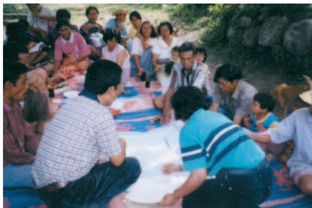
Managing lakes for their sustainable use requires the cooperation and involvement of all lake stakeholders, particularly the citizens inhabiting their drainage basins.

In contrast to the toolbox of immediate actions that can be used to address threats facing lakes, this section of the World Lake Vision identifies a range of broader strategic approaches directed to the goal of sustainable lake use. As longer-term initiatives, these strategies typically require sustained action over a period of year or even decades. Many span national boundaries, and might also be best implemented at the regional level. Nevertheless, many also are equally applicable at the local and community level. Their specific level of implementation will depend on the nature of the individual lake problem(s), and the capability of the relevant lake stakeholders to address them. This may include the level of the individual, communities and governments, non-governmental organizations, business and agricultural sectors, and/or scientific professionals and academicians. It is noted that action by governments commonly involves both a political process, requiring that legal and institutional frameworks be put in place, that relevant actions by established governmental agencies and units be implemented, and that the actions are subsequently enforced.