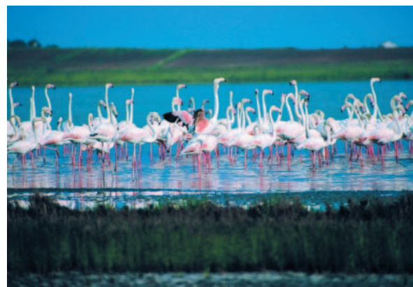
The huge numbers of organisms utilizing lake ecosystems attest to their ability to support significant biodiversity.

Lakes provide habitats for many aquatic organisms (fish, crustaceans, mollusks, turtles, amphibians, birds, mammals, insects, aquatic plants, etc.) and support biodiversity in the surrounding land areas, including many migrating bird species. These native species are well-suited to local conditions and typically live in balance with other aquatic life. Many support local fisheries and other economic activities. Around the world, however, thousands of water species have become threatened or endan-