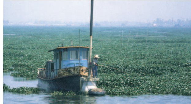
Invasive species, such as water hyacinth, can interfere with many lake uses.