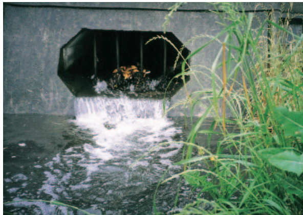
Water pollutants enter lakes from a range of point and nonpoint sources.

Contamination of water and sediments from toxic and hazardous substances can occur from many sources. Those of greatest concern to human and ecosystem health are some heavy metals (e.g., mercury, arsenic, cadmium, lead, chromium) and persistent organic pollutants (e.g., dioxins, polychlorinated biphenyls (PCBs), DDT and other pesticides). These pollutants are of particular concern because of their long life, and their ability to accumulate in lake sediments and in humans, aquatic and terrestrial organisms. Many are thought to cause birth defects, tumors and cancers in humans and wildlife. Chemicals that mimic natural hormones (“endocrine disruptors”), and pharmaceutical and medicinal residues with potentially adverse human health and reproductive implications, also are being detected in lakes with increasing frequency.