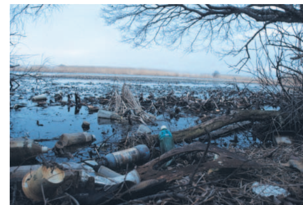
Litter degrading the Lake shoreline

The consequences of accumulated litter (durable goods, biodegradable items, containers and packing materials, etc.) include physical obstruction and reduction of the natural beauty of lake systems, and the less-obvious impacts associated with chemicals leaching from the litter. Macropollutants or solid wastes such as litter and garbage contribute to the spread of human disease organisms and can adversely affect native wildlife and domestic animals, particularly waterfowl. In areas where refuse collection is unavailable, discarded wastes from households, farms and marketplaces are