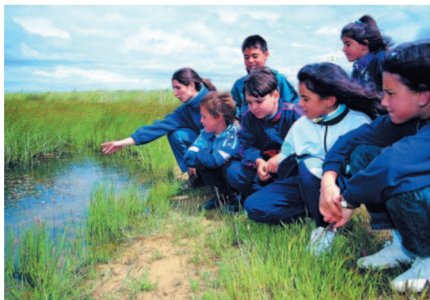
Educating children about water-related issues is a beneficial long-term measure for achieving sustainable lake use.

The World Lake Vision strongly supports the development of appropriate human resource capabilities to correct such deficiencies, including region-specific training. Inclusion of a component directed to effective capacity-building activities in all water resource investments can provide a means of promoting such training at the international level as well. Several training programs are available free-of-charge, or at very low cost, for almost every aspect of lake management. Examples include courses organized by the International Lake Environment Committee Foundation and the North American Lake Manage-