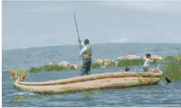
Lake fisheries provide the livelihood for many indigenous communities.