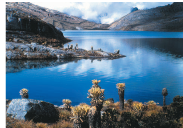
Lakes represent some of the most breathtaking features of the global landscape.

Not to be forgotten is the intrinsic beauty of lakes, many of which exhibit breath-taking aesthetic features. Lakes evoke a pleasing range of emotional, spiritual and intellectual responses in humans. Lakes have been described as “pearls on a river string,” and “islands of water in an ocean of land.” Although they are extremely important features, the aesthetic values of lakes are the most difficult to quantify, compared to their other uses.