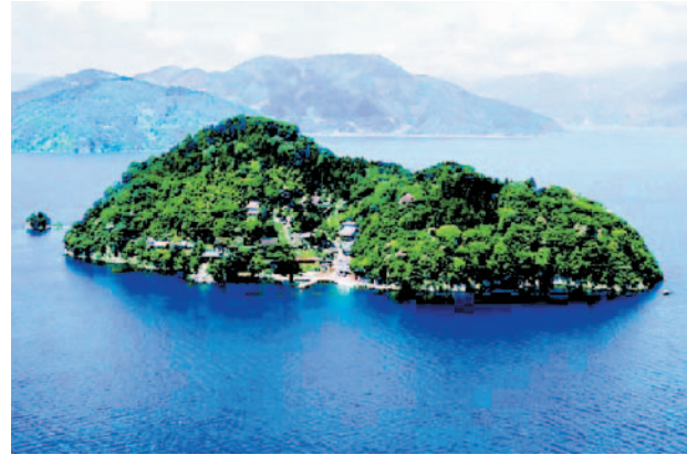
The goddess of water is enshrined on Chikubu Island in Lake Biwa, Japan.

nificance for many cultures. The Huichol in Mexico, for example, consider Lake Chapala a sacred site. Manasarowar Lake in Tibet, China, is another example of a sacred lake, where pilgrims gather from Tibet and neighboring areas. On Chikubu Island in Lake Biwa, the goddess of water “Benzaiten” is enshrined and worshiped.