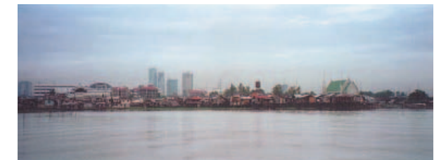
Inappropriate shoreline development can destroy aquatic habitats and degrade the aesthetic quality of lakes.

Over-development or inadequate control of construction activities, particularly along lake shorelines, degrades the natural beauty of lake landscapes, and can have negative impacts on lake water quality and nearshore biological communities. Although difficult to categorize in a quantitative sense, the aesthetic quality of a lake can readily disappear over time as a result of increasing human settlement and related activities in its drainage basin. Litter transported from drainage basins to beaches, littoral zones or left floating on the lake surface, also can reduce the economic value of lakes to local economies.