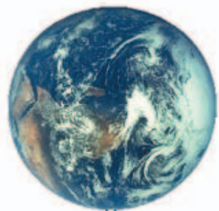
Although the blue color of Earth suggests the availability of large quantities of water, nearly all of it is in the oceans, unsuitable for most human needs.

Lakes have a fundamental role in nature's continuing cycle of evaporation, precipitation and flow of water on and below the land surface on its journey back to the sea. They form parts of larger aquatic systems that may include rivers, wetlands, and groundwater. However, if one could take a snapshot of all the liquid freshwater on the earth's surface at a given instant, it is estimated that more than 90% of it would be in natural and artificial lakes. Water enters lakes primarily from precipitation and runoff from the surface and/or seepage of groundwater into the lake basin.