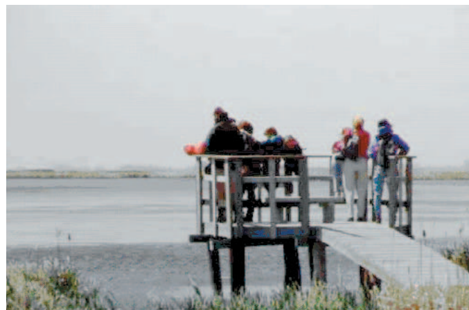
Lakes are a source of interest and inspiration for people of all ages.

The lack of a comprehensive vision for guiding human efforts regarding their sustainable use and conservation may lead to fragmented or insufficient lake management actions. Of equal concern is that this trend will ultimately hinder achievement of desired socioeconomic development. Without a holistic, integrated approach to lake management that focuses on their sustainable use, scores of lakes around the world can be expected to be less and less able to perform their ecosystem functions and provide life-supporting services, thereby also threatening the human communities that depend on them. The development of the World Lake Vision to address these needs, therefore, is both fundamental and essential.