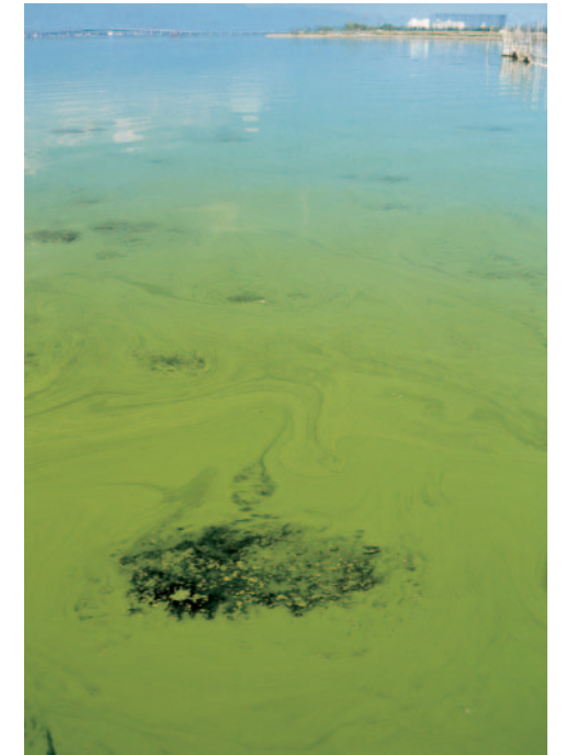
Algal scum, symptomatic of advanced lake eutrophication

Excessive nutrient loads (primarily phosphorus and nitrogen) can cause accelerated eutrophication, the accelerated growth of algae and aquatic plants to nuisance levels (e.g., algal blooms and floating weeds), with accompanying degradation of water quality and significant imbalances to lake ecosystems and their biological communities. Excessive nutrient inputs can stimulate the growth of toxic blue-green algal species detrimental to both livestock and human health. They also can interfere with beneficial human water uses, such as causing taste and odor problems in drinking water, and providing precursors of trihalomethanes, chemical compounds which have been identified as carcinogenic.