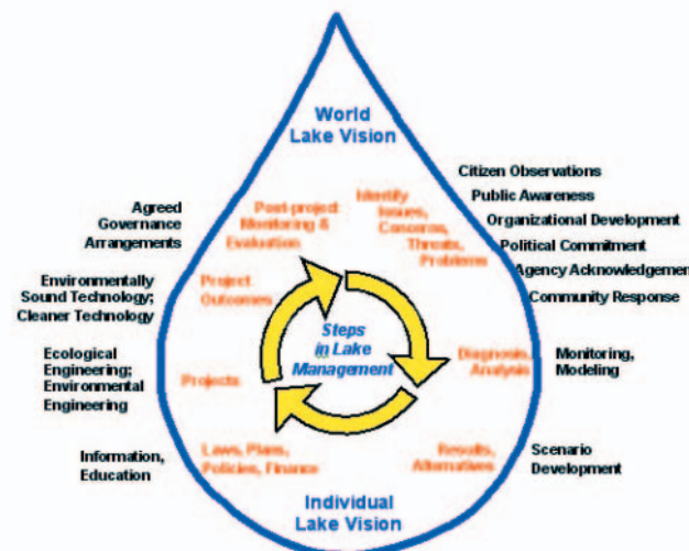
Figure 2. Management cycle for developing, implementing and refining individual lake visions.

in Figure 2. Because it represents a cycle of steps to be undertaken, the entry point into this approach to develop an individual lake vision will depend upon the extent of knowledge and information available, community structure, and level of stakeholder participation. The development of needed political commitment to undertake activities and programs directed to sustainable lake use must also be undertaken early in the cycle. This may include the creation of appropriate agencies, institutions and organizations, both within government and the local community.